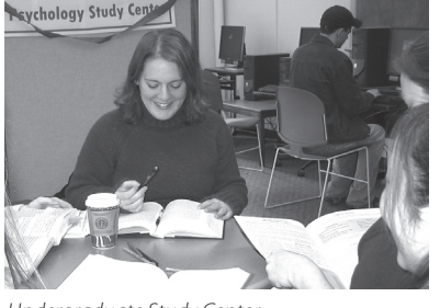
Undergraduate Study Center

The Study Center offers three computer workstations for student use, several small tables for studying, and a conference table for larger group meetings. Student, TA, and faculty response to the Study Center has been strong. "It's been terrific to finally have a place to meet up with other psych majors," said one senior, "it puts more of a 'friendly face' on the Department."